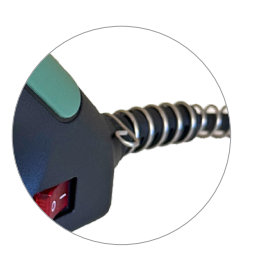
Reinforced design with rubber cable and additional protection.