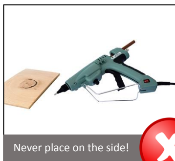
Never place on the side!