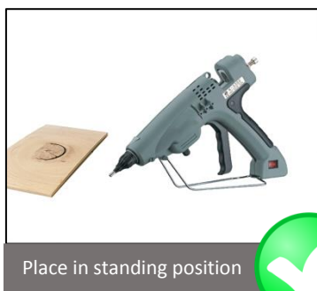
Place in standing position